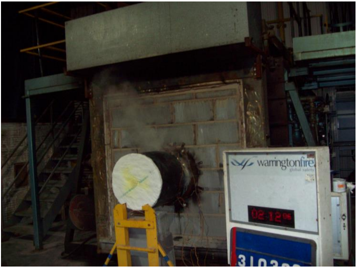
End of test

Fire Test on behalf of EDF Energy Nuclear Generation Ltd. Test duration – 136 minutes. In accordance with BS EN 1366-3:2009