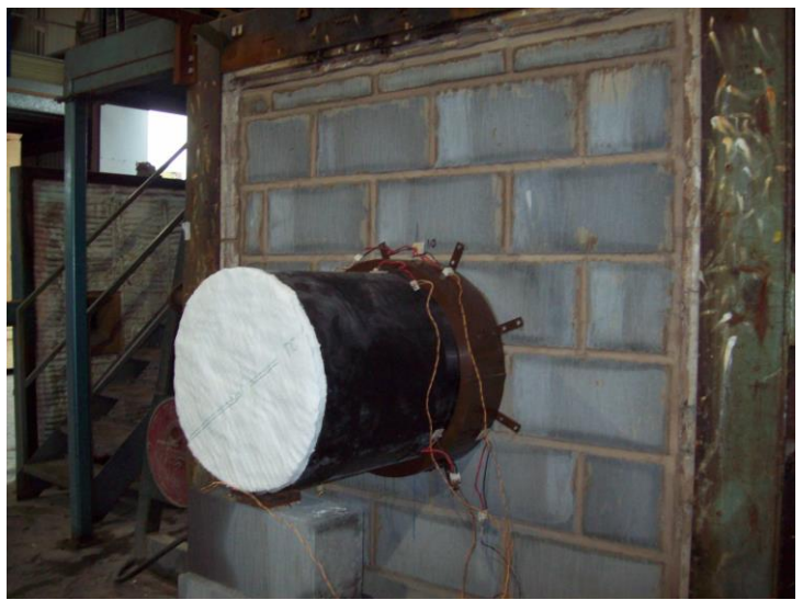
Beginning of test

Normally WPCS are fixed to the wall or ceiling on the risk side only. In some cases both sides are a risk side to a collar would then be fitted each side. Fixing instructions must be adhered to. The correct size collar must be fitted to the appropriate pipes and services.